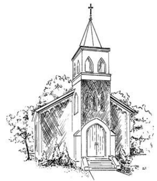
St. Stanislaus, Chatsworth Sunday 9:00 am